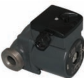
WTP GRUNDFOS UPS 25-60 PUMP