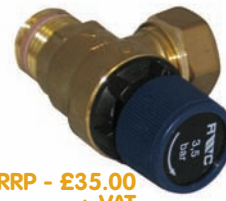
RRP - £35.00 + VAT Expansion Relief Valves WUVER

1/2" X 15MM - 3.5 BAR WUVER322 3/4" X 22MM - 3.5 BAR WUVER5 1/2" X 15MM - 5 BAR WUVER522 3/4" X 22MM - 5 BAR