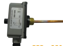
WPHNT 90°C HIGH LIMIT STAT