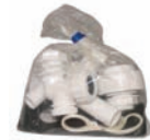
WPB30 BYELAW 30 KIT