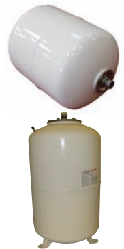
WU8EV 8 LITRE VESSEL