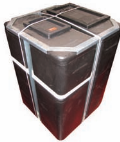
WPUTI INDIRECT POLYTANK