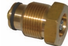
WUAVV1 1" ANTI-VACUUM VALVE