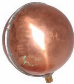
WPF4C 4.5" COPPER FLOAT