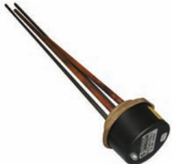
WUEIH30 30" IMMERSION CUT OUT & STAT