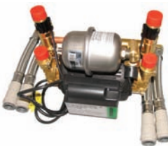
WPPNH MONSOON NEG 1.5 BAR TWIN PUMP