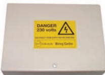
WTWC ACL WIRING CENTRE LCW1