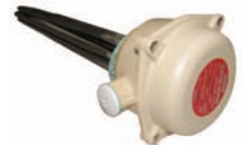
WIH6 6KW IMMERSION HEATER & STAT