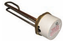
WIH 11" 3KW IMMERSION AND STAT