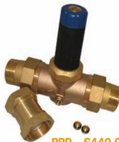
WUCWCP5 2" PRV & 2" CHECK VALVE