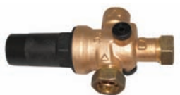
WSUPRV 22mm PRESSURE REDUCER 2.1BAR c/w BALANCED COLD