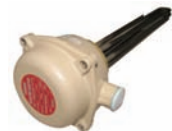
WIH9 9KW 16" 415V 3 PHASE IMMERSION