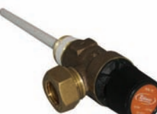
WUVTP722 22MM T&P RELIEF VALVE 7 BAR