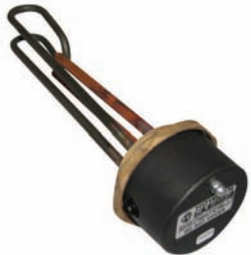
WUEIH 11" IMMERSION CUT OUT & STAT