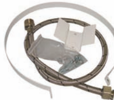
WUWK EXPANSION VESSEL FIXING KIT