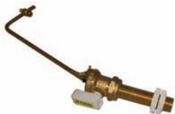
WP15BVJL 15MM JETSEAL B/V LONG TAIL