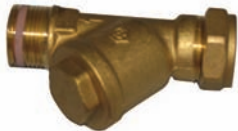
WTYS 22MM Y STRAINER COMP X MALE