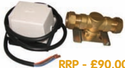
WUEMZV28 28MM MOTORISED ZONE VALVE