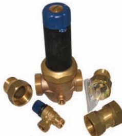
WUCWCP3 COLD WATER CTRL PACK 3 1 1/4"