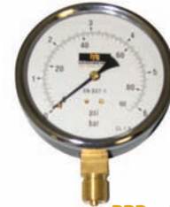
WCPG 100MM DIAL PRESSURE GAUGE 0-7BAR