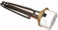
WIHLWD 16" INCOLOY 3KW IMMERSION LWD