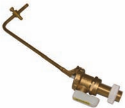
WP15BVJ 15MM JETSEAL BALLVALVE