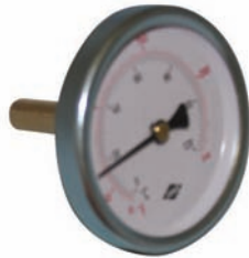
WTherm 2" THERMOMETER