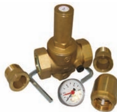
WUCWCP4 1 1/2" PRV, GAUGE CHECK VALVE