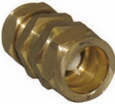
WUVC1 28MM SINGLE CHECK VALVE