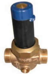
WUVPR1 28MM PRESSURE REDUCER ADJUSTABLE