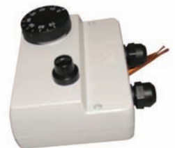
WUEDAC DUAL THERMOSTAT CONTROLLER