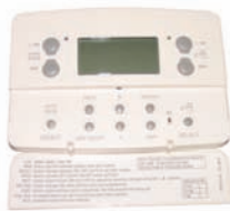
WTPROG DANFOSS FP715 PROGRAMMER