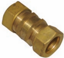
WTCV 22MM CHECK VALVE