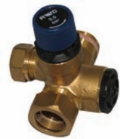
WSUVER 3/4" CHECK & EXP VALVE 3.5B