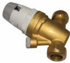
WUVPRC 3/4" PRESSURE REDUCER 1.5 BAR