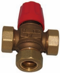
WTTMV THERMOSTATIC MIXING VALVE 22MM