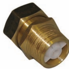
WUVC 22mm X 3/4" MI CHECK VALVE