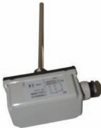
WTCT IM - TC2 CYLINDER THERMOSTAT